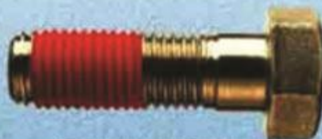
Precoating of threaded parts with thread sealing compound such as Loctite 575, Pwcoak 66 ensures highest looking effect, sealing properties and maximum quality of the product.