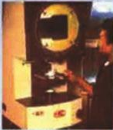
OPTICAL PROFILE PROJECTOR

The Quality systems spread out in various stages, which begins at selection of Raw material, Equipments, Production and ends with the finished products.