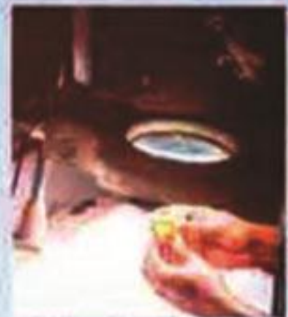
VISUAL INSPECTION IN MAGNIFIER