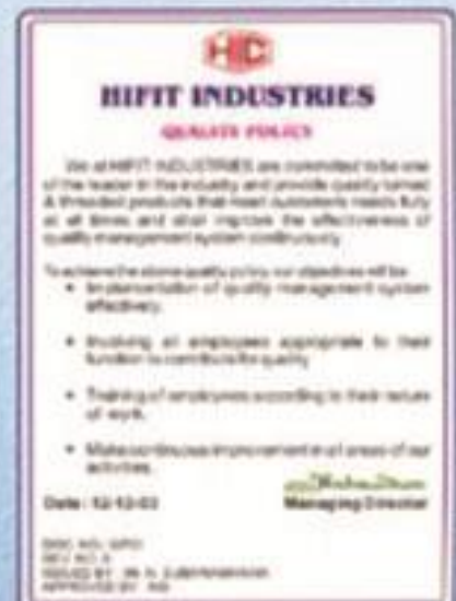
HIC Quality Policy