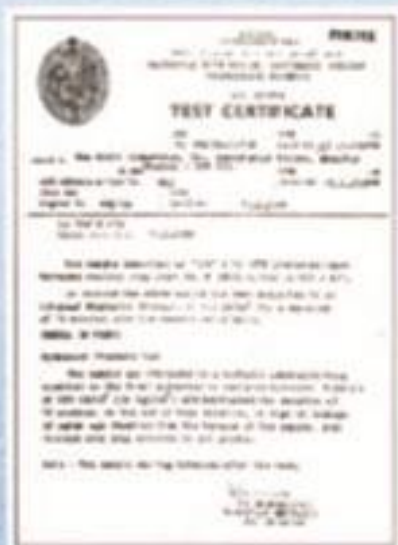
National Test House